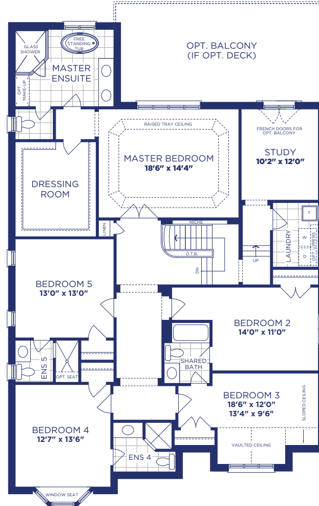
ALTERNATE UPPER FLOOR PLAN WITH STUDY, EL. 'A'