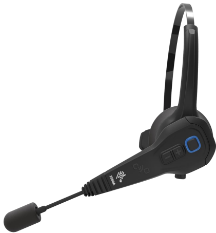
HS3100 Bluetooth Headset