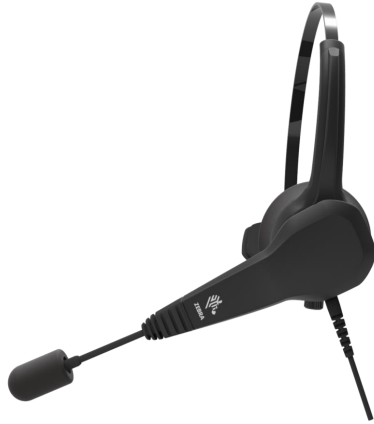
HS2100 Corded Headset