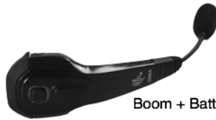
Boom + Battery + Windscreen