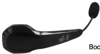
Boom + Windscreen

HS3100 Boom Module Includes microphone boom, battery, and Windscreen