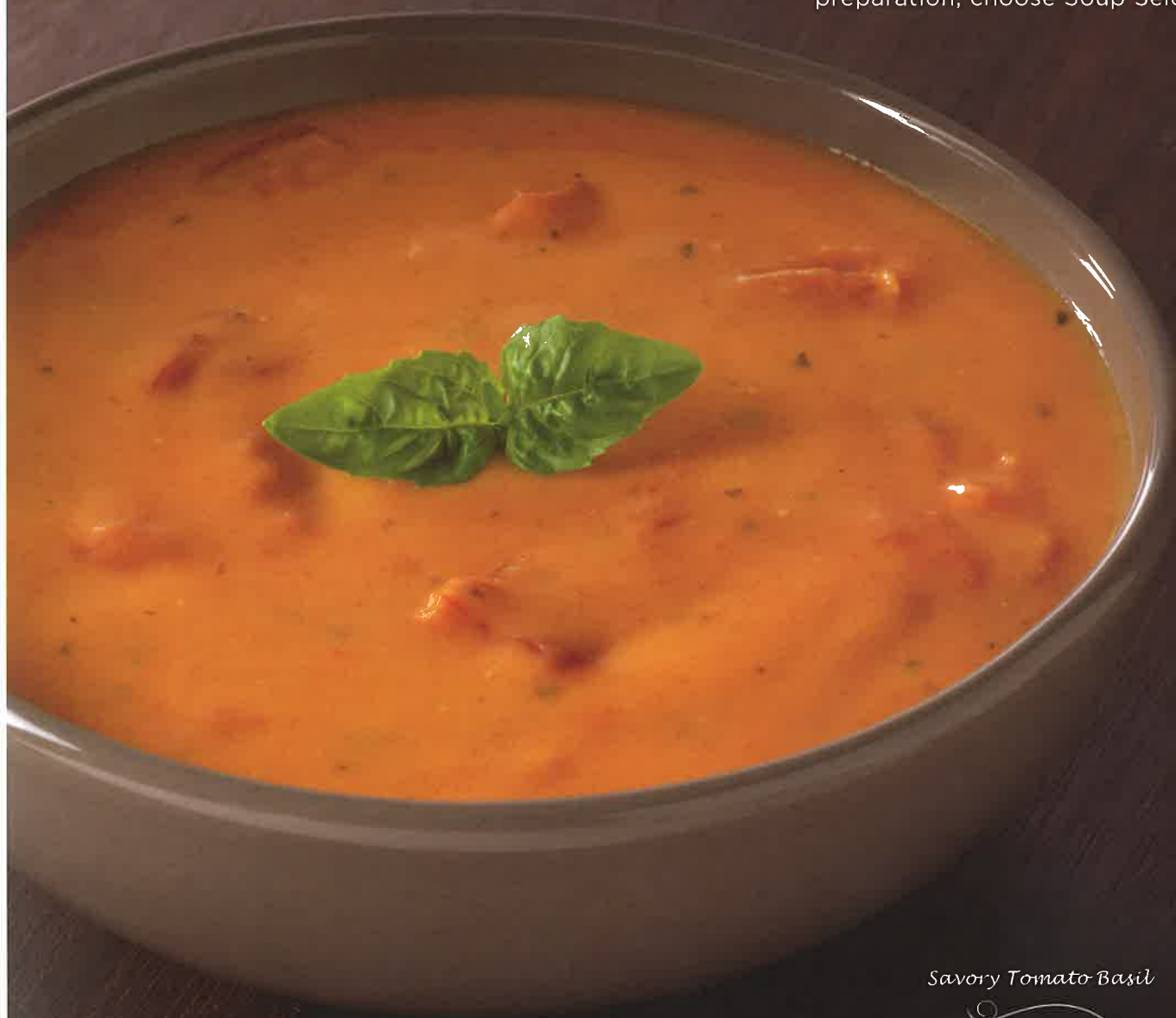
Savory Tomato Basil

Featuring bright colors and fresh flavor, Soup Select delivers consistently delicious results every time. The convenience of everything in one bag means all you do is cook and serve, nothing to add. When you want satisfying flavors, and quick preparation, choose Soup Select.