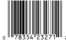
3271 1/36lb Regular Sour Cream