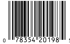
0205 6/5lb Regular Sour Cream