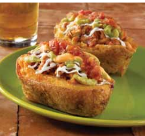
Delicious potato boats with pulled pork.

Every Penobscot McCrum product begins with perfect Maine potatoes and ends with your 100% satisfaction—that's our gold standard promise. We are a Maine family enterprise five generations strong and we have one single focus: to provide the finest frozen potato specialty products on the market today.