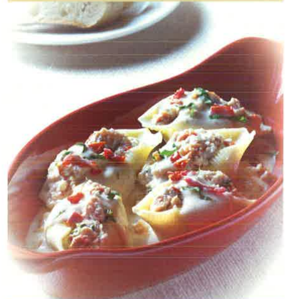
made with Chopped Ocean Clams