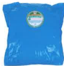
Mascarpone Bag Pack Size: 1/20 lb. Code: 2622