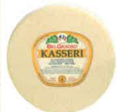
Kasseri Wheel Pack Size: 1/24 lb. Code: 2684

For information concerning BelGioioso items, please contact: