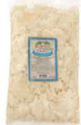
Shaved Salad Blend Bag Pack Size: 4/5 lb. Code: 2588