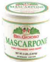
Mascarpone Tub Pack Size: 4/5 lb. Code: 2482