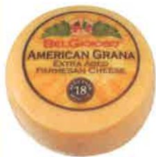
American Grana® Wheel Pack Size: 1/65 lb. Code: 12614