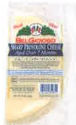
Sliced Sharp Provolone Stack Pack Size: 12/1 lb. Code: 2661