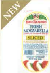
Fresh Mozzarella Pre-Sliced Thermoform Log Pack Size: 8/1 lb. Code: 2518