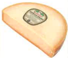
American Grana® Quarter Wheel Pack Size: 8/16 lb. Code: 2404