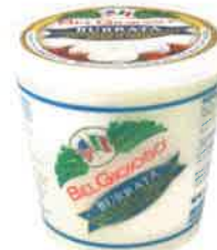
Burrata Cup 4-4 oz. Balls Pack Size: 6/1 lb. Code: 12815