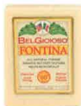
Random Weight Fontina Wedge Pack Size: 1/10 lb. Code: 2377