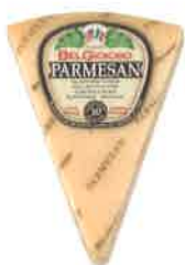
Random Weight Parmesan Wedge Pack Size: 1/10 lb. Code: 2379