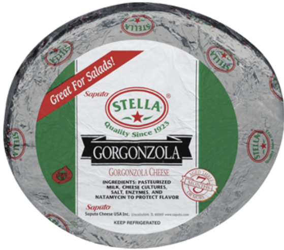
Current Dimensions* Height: 2.50" Diameter: 11.25"