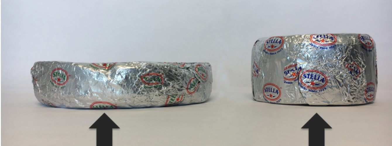
Current Dimensions* Height: 2.50" Diameter: 11.25"