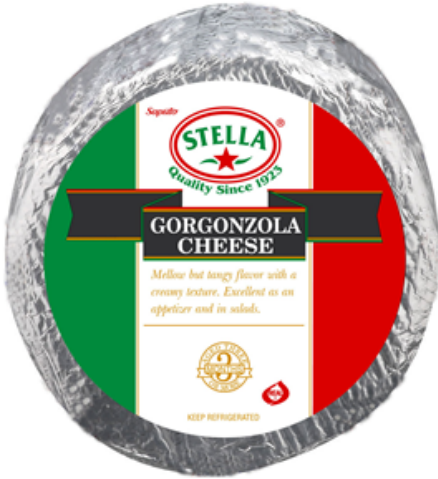
NEW Dimensions* Height: 4-4.5" Diameter: 7-7.75"