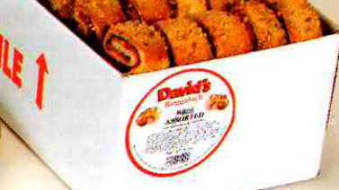
433/10433 5 lb. Country Style Assortment