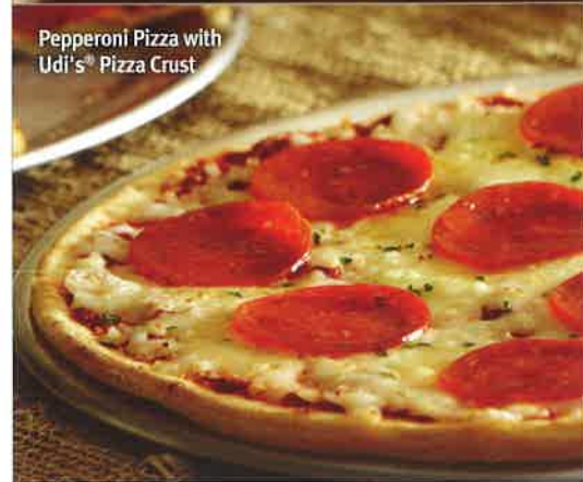
Pepperoni Pizza with Udi's® Pizza Crust