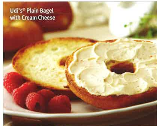
Udi's® Plain Bagel with Cream Cheese