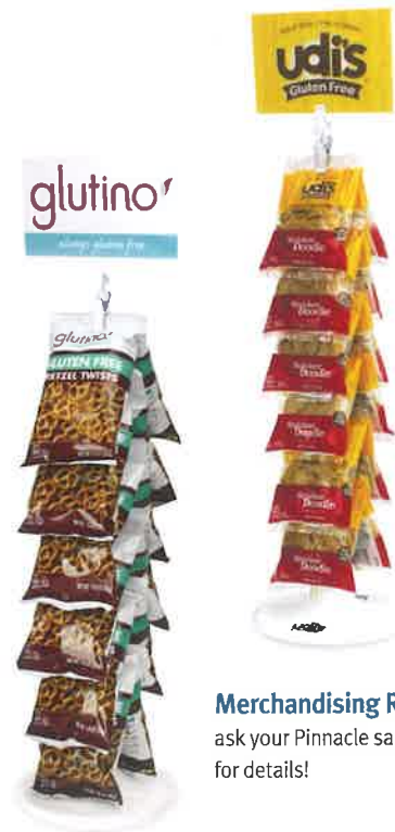
Merchandising Racks – ask your Pinnacle sales rep for details!